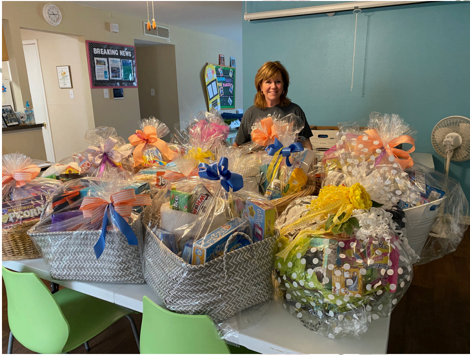
Reading Intervention door prize baskets